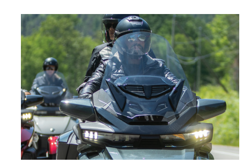
PREMIUM LED HEADLIGHTS

Premium LED headlights leave nothing hidden around the next turn with improved road visibility and precision lighting.