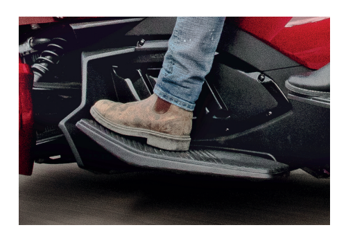
TOURING FLOORBOARDS With the 23 in. (58.4 cm) touring floorboards,

With the 23 in. (58.4 cm) touring floorboards, riders can now sit however they are most comfortable and change leg positions on long rides while enjoying easy access to the brakes.