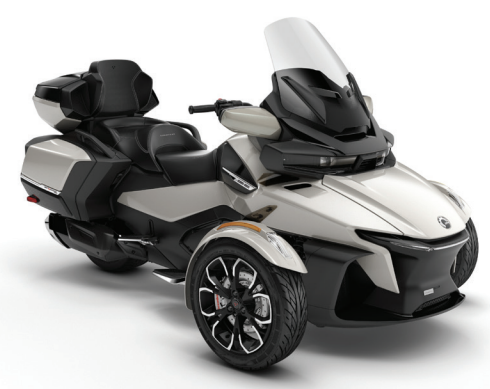
CHALK METALLIC* CHROME EDITION