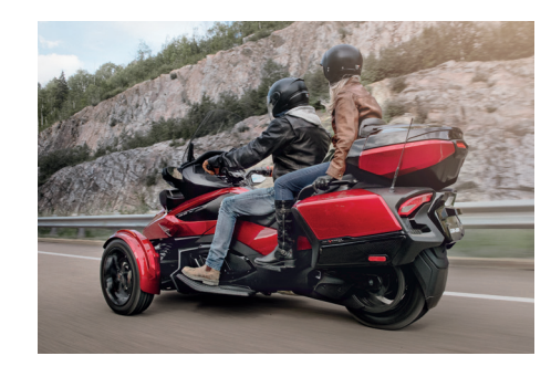
SELF-LEVELING AIR SUSPENSION

Premium LED headlights leave nothing hidden around the next turn with improved road visibility and precision lighting.