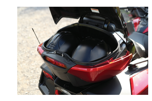
LinQ COMPATIBLE TOP CASE

The adjustable electric windshield with memory function provides superior wind protection, and the memory function automatically returns the windshield to the lowest or previous height.