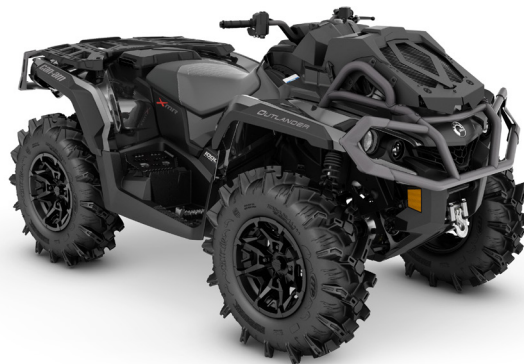
Granite Gray, Black & Manta Green / 1000R Black & Platinum Silver / 1000R